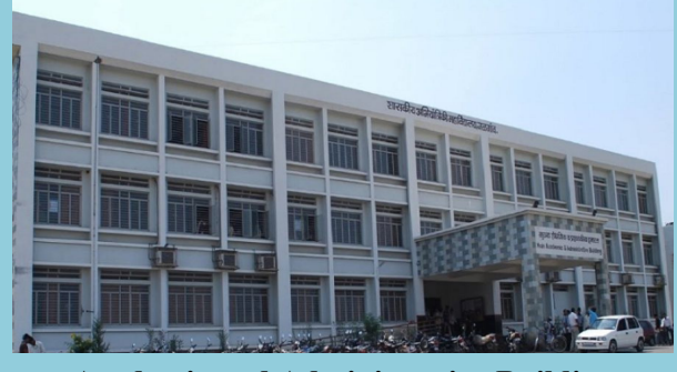
Academic and Administrative Building

Institute is spread over 19.38 acres of land in the heart of Jalgaon city. All departments possess well equipped laboratories and classrooms to provide great learning ambiance. Boys' and girls' hostels, officers and staff residential facilities are available in campus. The institute has AC seminar hall to organize institute level programs such as Seminar, workshop, T&P activities etc.