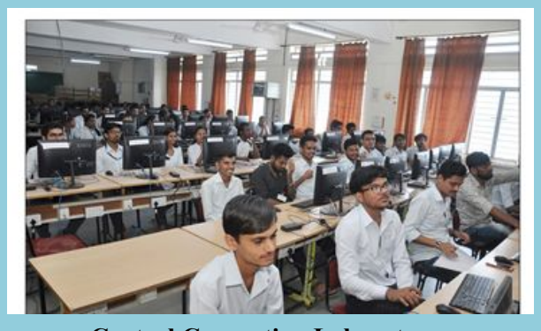
Central Computing Laboratory